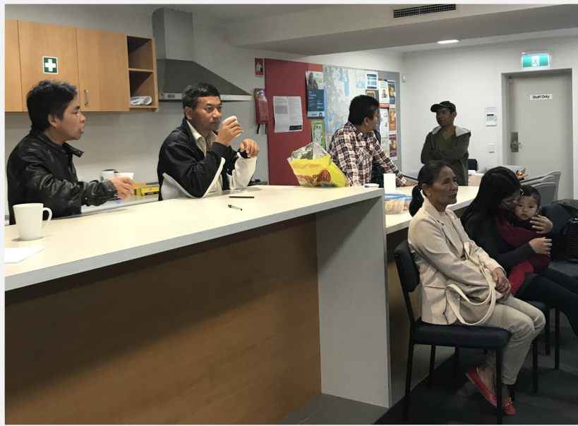
Left: Community getting tested as part of the MHOH program

MHOH would like to share some photos from our recent community events. Thank you to all those involved in making the events possible and also to those who participated.