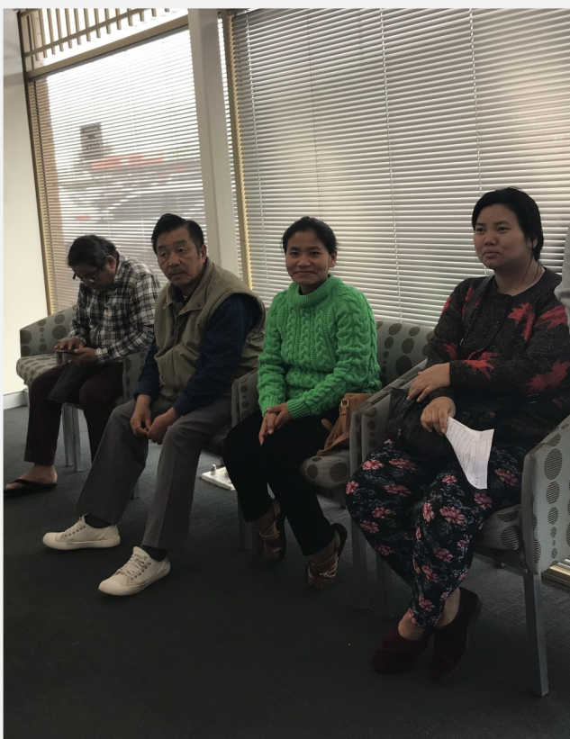
Right: Community seated in front of the art work from the Harmony Art Collective Workshops, which were organised by the SBS